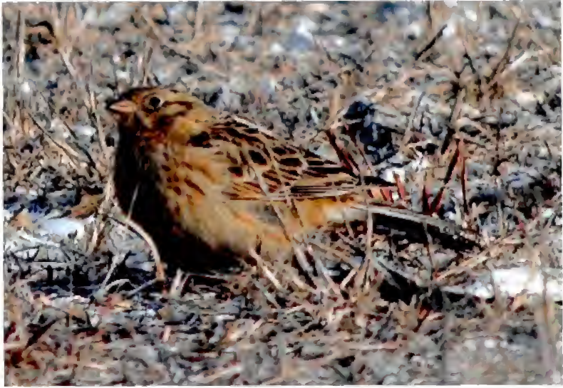
Figure C. Smith's Longspur, Jones Beach West End, Nassau Co., 12 Feb 2007.